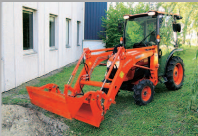
GRAPPLE BUCKET 4-IN-1